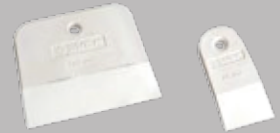
Rubber putty knife