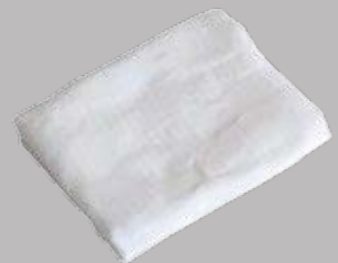
Cotton waste (Cloth)