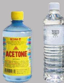
Acetone. White spirit