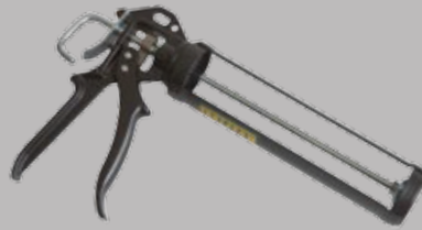
Glue applicator gun