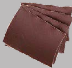
Fine grain abrasive paper