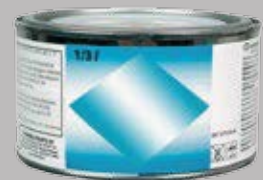
Fine grain water-soluble filler